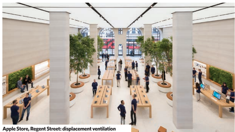
Apple Store, Regent Street: displacement ventilation integrated into the joinery for improved indoor air quality and energy efficiency, and radiant floor heating and cooling

However, there is a clear need for innovative energy recovery systems, which prevent the transfer of contaminants between incoming and outgoing air streams, and novel dehumidification technologies – such as liquid desiccant – to reach maturity quickly. The challenge for built environment engineers and designers is about to get tougher. It's an exciting time to be in the industry.